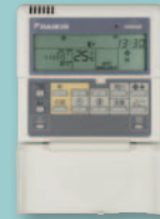
BRC1D52 Wired remote control (standard)