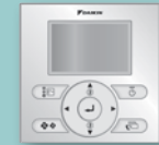
BRC1E51A Wired remote control (optional)