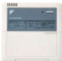
wired remote control

The switch box can be reached from the side or from the bottom side of the unit for easy servicing.