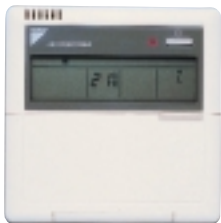
wired remote control

Compact FDYP units are concealed ceiling units with a high external static pressure and very low sound levels. Its casing is very compact with a height of 350mm (125 class) or 450mm (200 and 250 class).