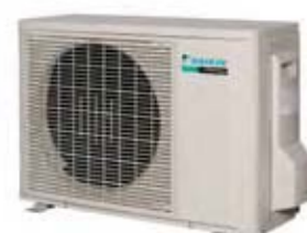
RXS 25,35 F