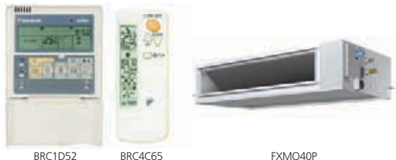
BRC1D52 BRC4C65 FXMQ40P