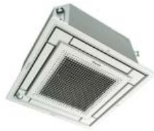
FXZQ-A (matt crystal white panel)