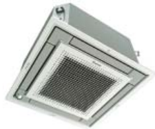
FXZQ-A (silver and matt crystal white panel)