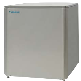
HXHD-A (High temperature hydrobox)