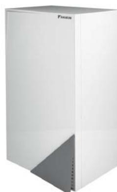
HXY-A (Low temperature hydrobox)